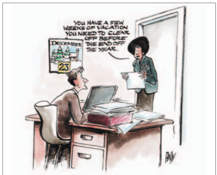
The samples above are from our 2011 HR Wall Calendar